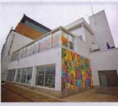
The asking price for the Shad Thames building could top £7m.

on a museum scheme in London to extend and refurbish the Magazine Storeyard in Kensington Gardens, declined to comment but under the architect's proposals the museum is expected to be filled with a series of models of contemporary architecture. Stephen Bayley, who set up the Design Museum with Terence Conran, said that the building would be "perfect for someone who wanted a ready-made museum". The building has exhibition space over two floors and a restaurant on the first floor, which under the current terms of the sale